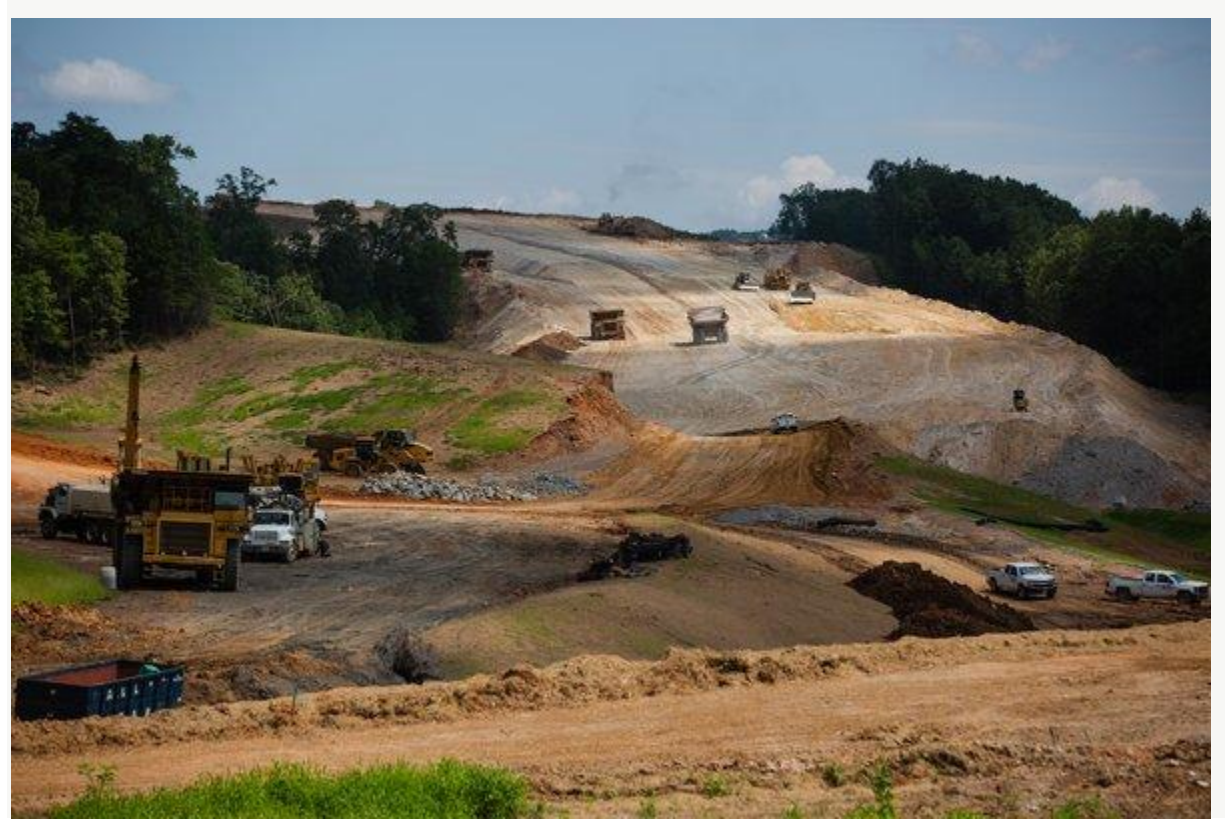
Construction on a road that will connect LakePoint's north and south campuses. The north campus is not yet built.

The Peach State Basketball Classic was considered a boutique exposure tournament for the nearly 100 teams that participated, and there were college coaches carrying clipboards roaming the special lanes between courts reserved for them — set up to allow them to watch players away from parents. The coaches wore shirts bearing the logos of every kind of program: Bible colleges and Ivy League universities, big state schools and small liberal arts institutions. Signs for scouting services and sneaker companies surrounded the courts.