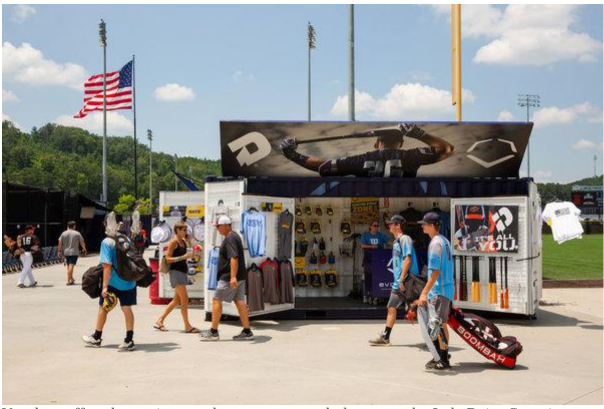
Vendors offered sporting goods to parents and players at the LakePoint Sporting Community in Emerson, Ga. By Joe Drape

EMERSON, Ga. — Just past the Hampton Inn and the Chick-fil-A, beyond the climbing wall but not as far as the water park, is your field of dreams. Actually, there are eight of them: all major league-sized, synthetic-turfed and LED-lit, and wedged in next to the three soccer pitches. The Champions Center is ahead on your left, where a dozen basketball courts can be converted into two dozen for volleyball.