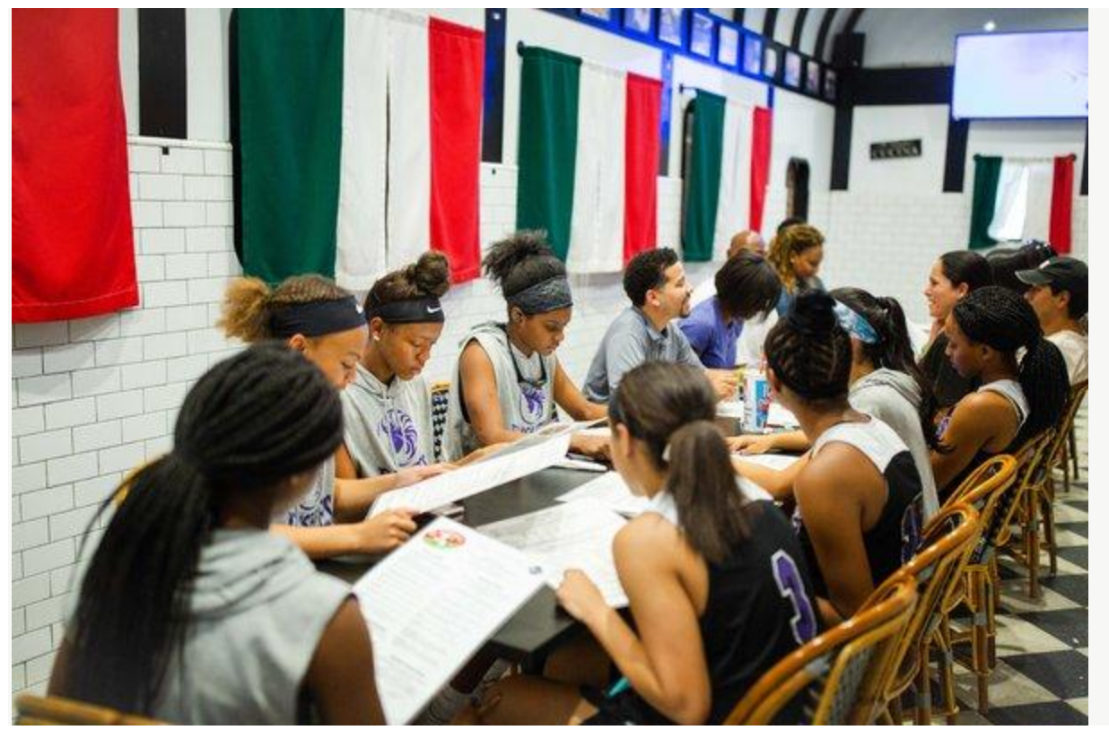
The Mid South Banshees, from Memphis, Tenn., dining at a pizza restaurant near LakePoint. The Banshees were among about 100 teams who came to LakePoint for a tournament in July.