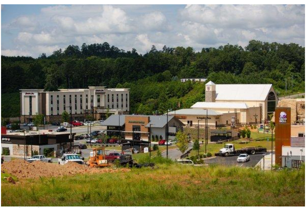
Hotels and restaurants around the LakePoint complex. More of both are planned.

As families travel more miles so their children can play more games and be seen by more college recruiters, sprawling complexes like <a href="The Grand">The Grand</a> <a href="Park Sports Campus">Park Sports Campus</a> in Westfield, Ind., <a href="Rocky Top Sports World">Rocky Top Sports World</a> in Gatlinburg, Tenn., and <a href="LakePoint">LakePoint</a> have fine-tuned both their facilities and their programs to attract millions of visitors every year. And as they have succeeded, these megacomplexes — and other hybrid sports/vacation destinations like them — have become staples of yet another growing youth sports phenomenon: the tourna-cation circuit.