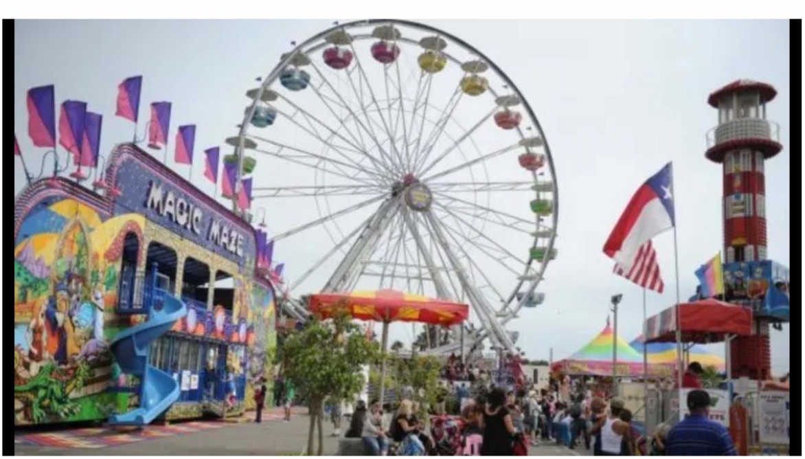
Authorities have arrested four suspects in connection with the theft of more than $500,000 from the Ventura County Fair in August.

Four Los Angeles County men have been arrested in connection with the theft of more than $500,000 at the Ventura County Fair in August.